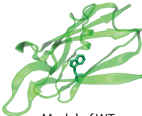
Model of WT structure