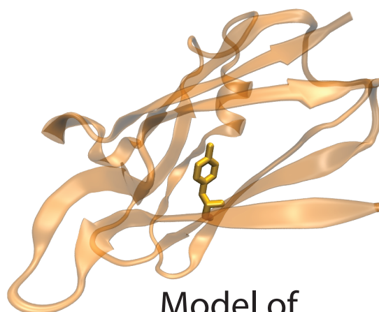
Model of mutated structure