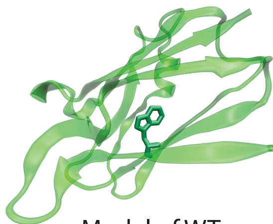
Model of WT structure