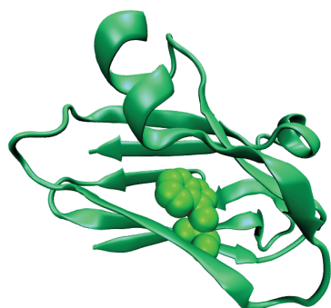
Model of WT structure